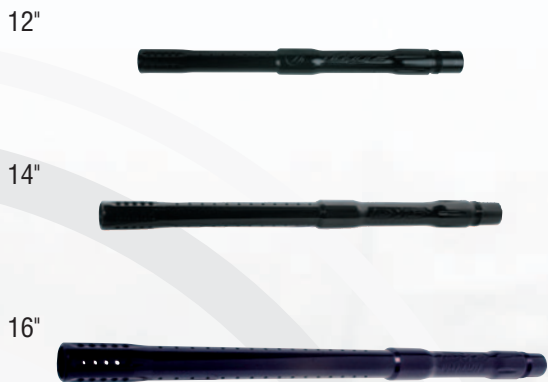
12", 14", or 16" Lengths for Autococker, Angel, Impulse, Model 98, and Spyder