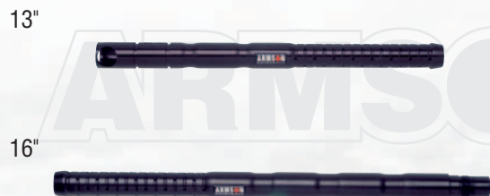
Available in Black 13" or 16" Lengths for A-5, Autococker, Alley Cat, Automag, Angel, Model 98, Pro-lite, Raptor, Shocker, and Spyder