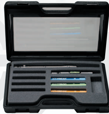
Lengths for Autococker 3 Inserts, Model 98 3 Inserts, Spyder 3 Inserts