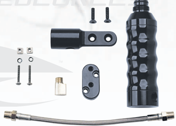
Expansion Chamber Kit