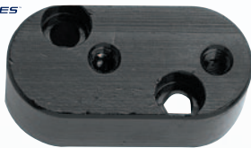
Block - Allows for Standard Duckbill